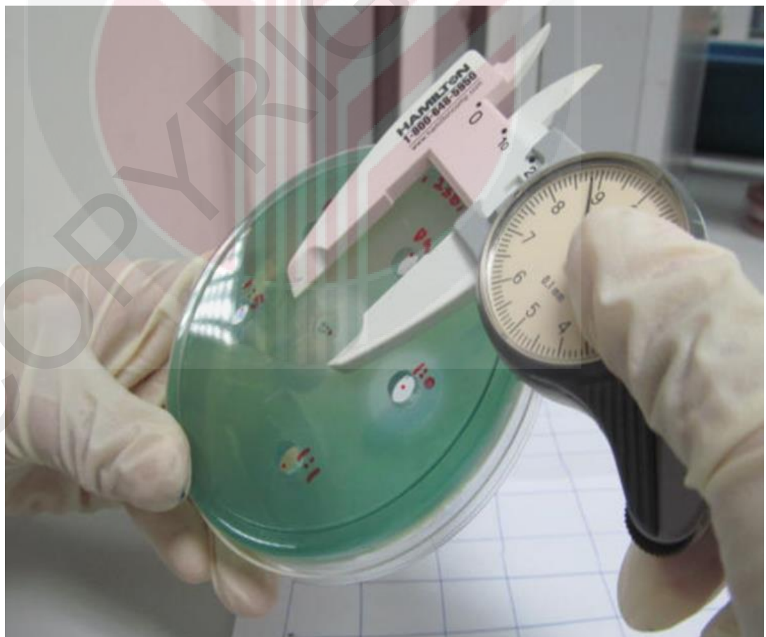
Figure 2: Measuring the zone of inhibition using Vernier callipers

This part of the experiment was to determine the antibacterial activity of each of the tested honey, being in pure and undiluted. Pasteurella multocida was the most susceptible bacteria when tested against honey. It was sensitive against 4 honeys (except against artificial honey) with the highest zone against Propolis, followed by polyfloral, Manuka and Kelulut. The mean inhibition zone was in fact (20.96 \pm 3.56) mm in diameter. On the other hand, the least susceptible bacteria was P. mirabilis which was resistant to all the 5 honeys, and hereby had a mean inhibition zone of (5.71 \pm 3.86) mm diameter.